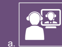
a. Screening / Pre-interview