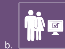
b. Selection / Interview